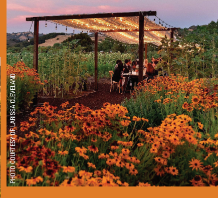
The Equestrian Center offers boarding facilities and trail horses for member rides. Above: Sunset dining in the organic garden.