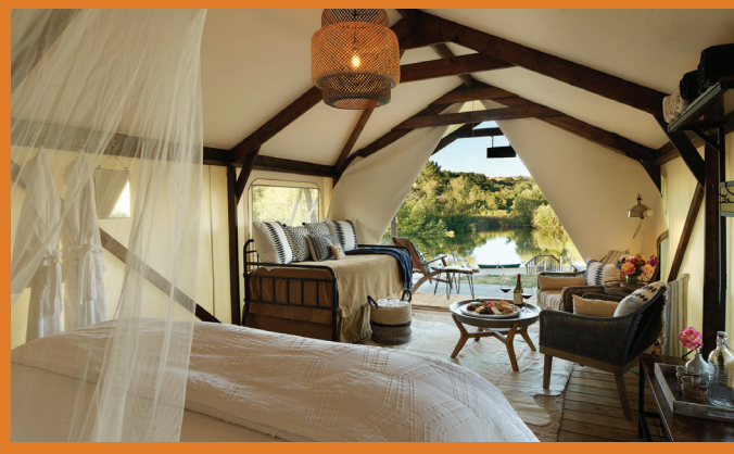
Overlooking Moore's Lake, an outfitted vintage Shepherd's Wagon, and two elegantly appointed, fully-provisioned glamping tents offer an idyllic connection to a bygone era. The largest bass caught weighed in at a hefty 18 pounds. A popular pastime is maneuvering one of the club-owned rowboats mid-lake for an afternoon of birdwatching.