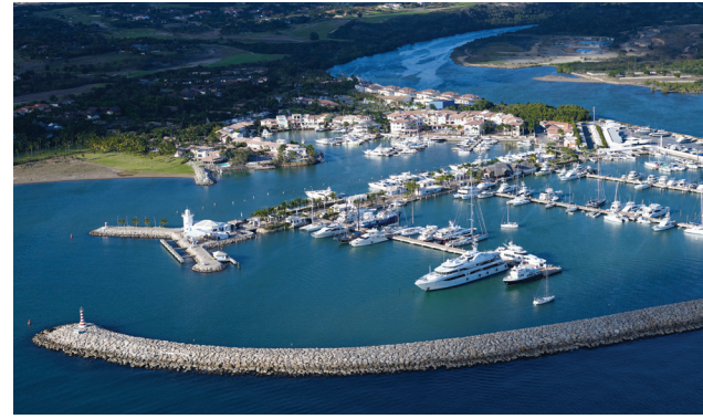
With water just offshore teeming with blue marlin, you never have far to go to fish in some truly spectacular seas. Inspired by the quaint seaside villages that dot the Mediterranean coastline, the marina is more than just a place to moor, it's an entire community for sport fishermen.