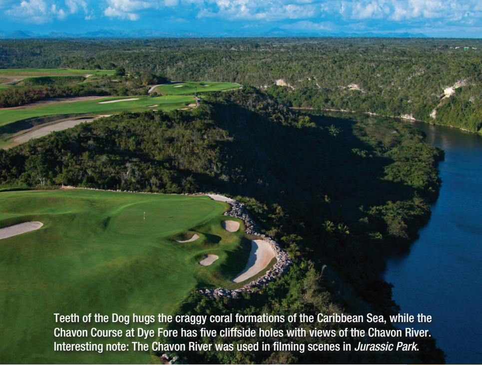
Teeth of the Dog hugs the craggy coral formations of the Caribbean Sea, while the Chavon Course at Dye Fore has five cliffside holes with views of the Chavon River. Interesting note: The Chavon River was used in filming scenes in Jurassic Park .