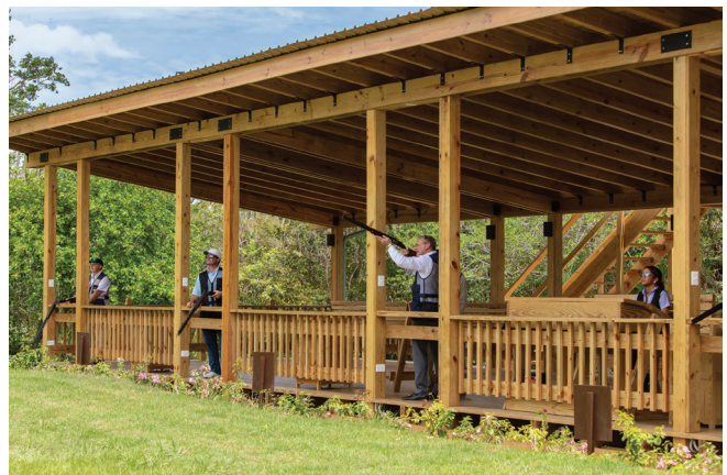
The 245-acre outdoor Shooting Centre has 200+ stations for trap, skeet and sporting clays, and pigeon rings. Its 110-foot tower that projects sporting clays is one of the largest in the world.