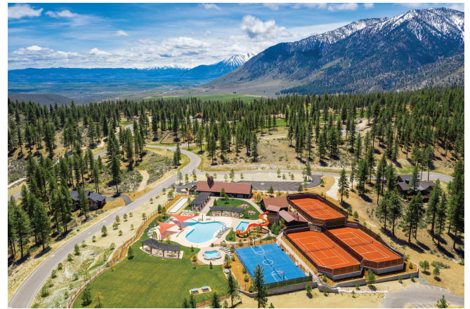
Summit Camp's water slide is crafted from massive 100-year-old timbers reclaimed from the adjoining Schneider Ranch.

Even when the sun rises before six and sets after eight, there never seems to be enough hours on a summer day.