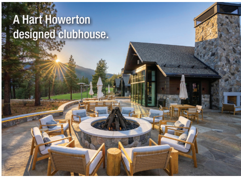
A Hart Howerton designed clubhouse.