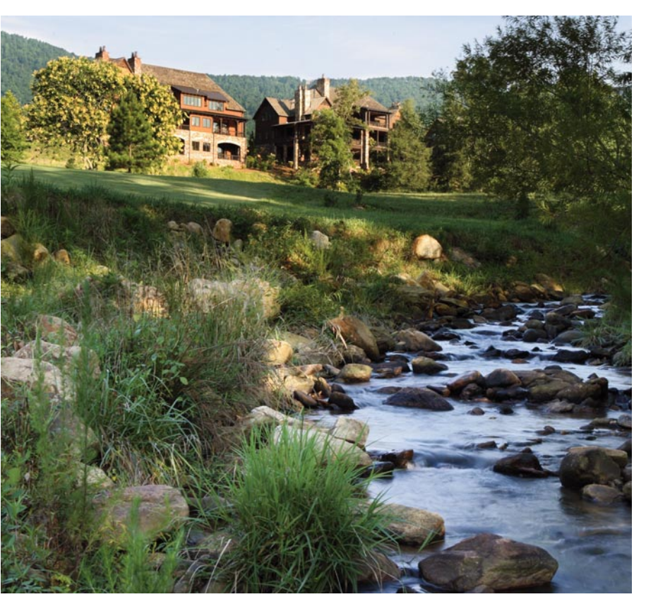
Bright's Creek is named for a stream that starts at a natural spring atop Wildcat Spur Mountain, flows through the property, and eventually feeds into the Green River. The area is so quiet that you can hear a putter strike a golf ball from 100 yards away.