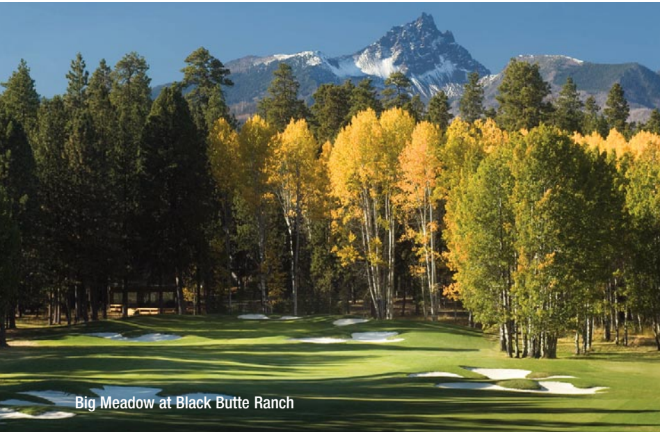
Big Meadow at Black Butte Ranch

The region is known as an outdoor-lovers paradise with