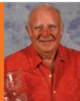
Men's Gross Division (75 and Over) BOB HOPE Del Paso CC (California) 82-88 — 170