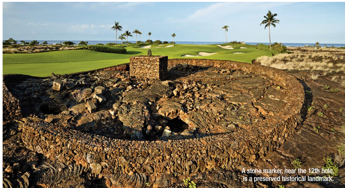
A stone marker, near the 12th hole, is a preserved historical landmark.

Kohanaiki is a new, private community aligned with the culture of the Big Island and built and designed with an environmentally sustainable infrastructure. The club is private. It includes a Rees Jones designed golf course, an exclusive beach and activities center, fine dining facilities, a serene pool, and a luxurious clubhouse and spa.