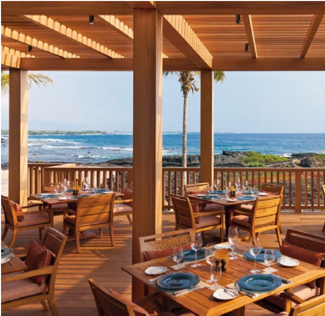
THE KOHANAIFI BEACH RESTAURANT offers spectacular oceanfront dining. The dinner plates are translucent blue to symbolize the ocean. The indoor dining area and bar has chandeliers shaped like ancient Hawaiian fish baskets.