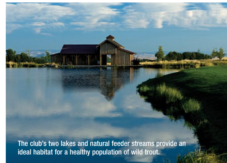
The club's two lakes and natural feeder streams provide an ideal habitat for a healthy population of wild trout.