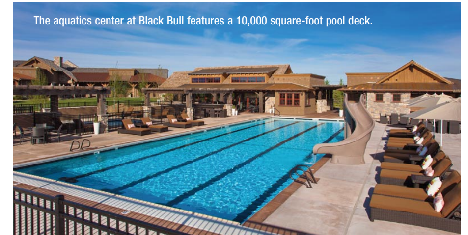
The aquatics center at Black Bull features a 10,000 square-foot pool deck.

FRONTIERSMAN NELSON STORY DROVE 1,000 HEAD OF LONGHORN CATTLE, DOWN BOZEMAN TRAIL IN 1866 TO FORM ONE OF MONTANA'S EARLIEST SIGNIFICANT RANCHES.