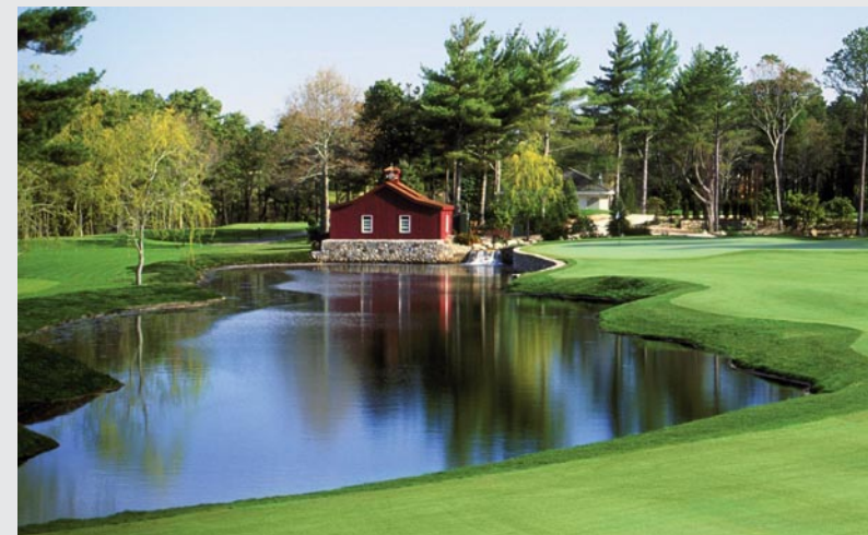
WILLOWBEND ON CAPE COD, MASSACHUSETTS, provides extraordinary living in an area that's been one of America's most popular vacation destinations for decades. Every year, new real estate living options and amenities emerge at Willowbend to add to its 27 holes of golf amongst red barns and working cranberry bogs. The club is known for its philanthropic efforts and attracts a veritable who's-who of athletes and celebrities. Greg Norman, Jimmy Connors, John Elway, and Mark Wahlberg are just a small sampling of superstars who have come to Willowbend to support worthy causes. For more information, visit www.WillowbendCapeCod.com .