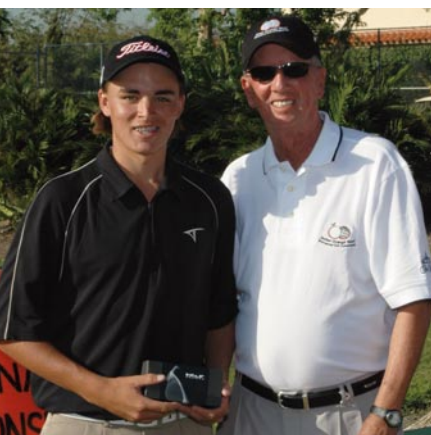
Rickie Fowler, 2015 PLAYERS Champion, receiving his Daily Medalist Prize at the 2005 Junior Orange Bowl Golf Championship.

The Junior Orange Bowl Championship, hosted by The Biltmore Hotel, has been a launching pad for several of today's best players. "The tournament was an eye opener for me," recalled Sergio Garcia. "I was a kid from Spain playing an incredible junior event in Miami. I have great memories of the golf course and The Biltmore Hotel. The course was fun to play and I still remember Al Capone's suite!"