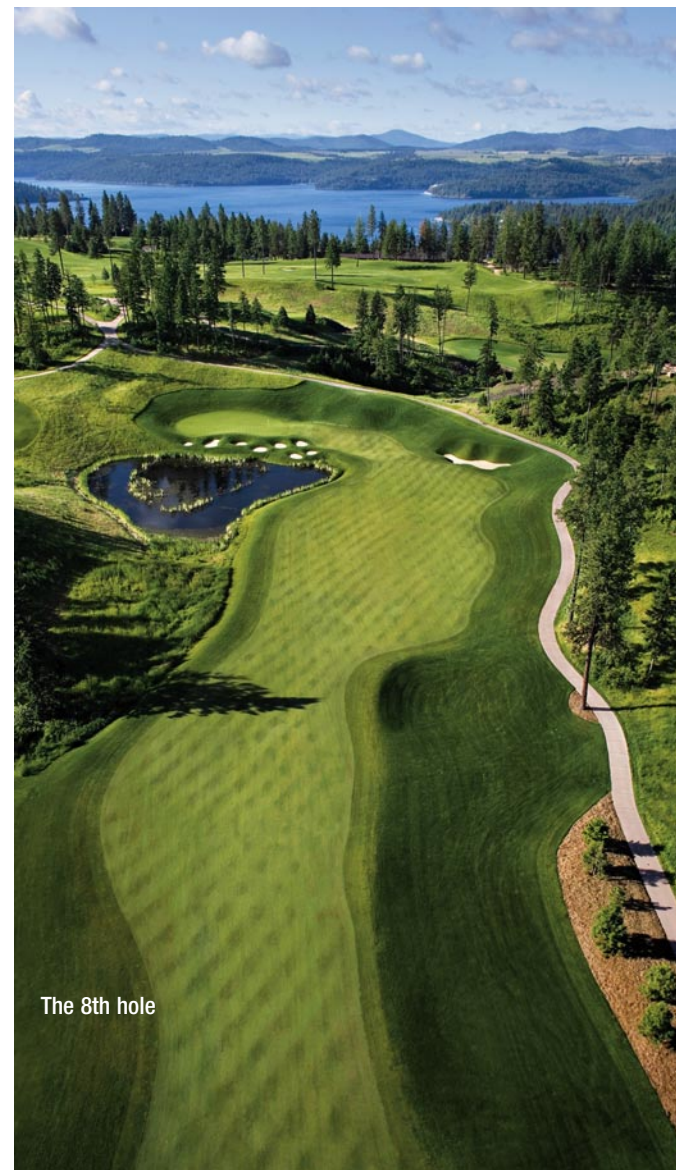
The 8th hole

“OUR COURSE IS A STORY of two tales. Several holes feature steep ridges and sharp drop-offs while others play through a wide prairie plain with generous fairways.”