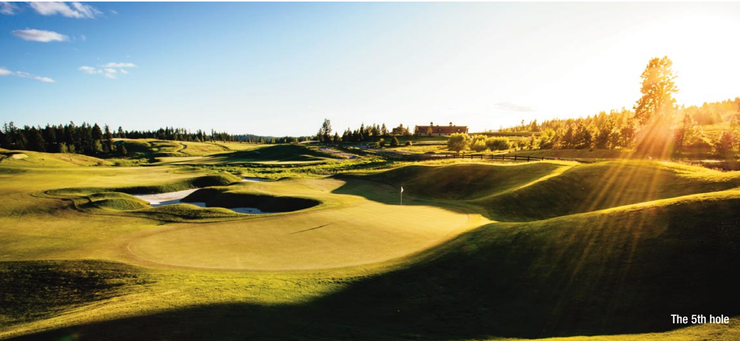
The 5th hole