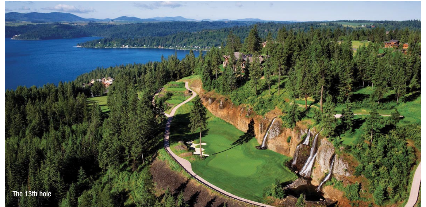
The 13th hole

For membership information and an additional peek at the beauty of The Golf Club at Black Rock, visit their website, BlackRockIdaho.com , or call (208) 676-8999.