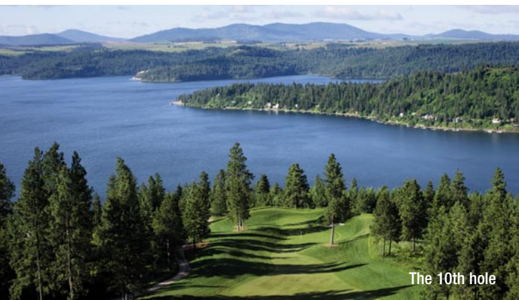
The 10th hole

“The Golf Club at Black Rock is the place to get away,” said Shatana Pole, general manager. “Our members come from all around the country between May and September to escape the heat. Everything we do focuses on providing the finest in service without being overly pretentious. Our summers are fairly dry, with little humidity, and we don’t have to battle insects. With elevation at only 2,000 feet, those with heart conditions won’t be impacted by thin air,” advised Pole.