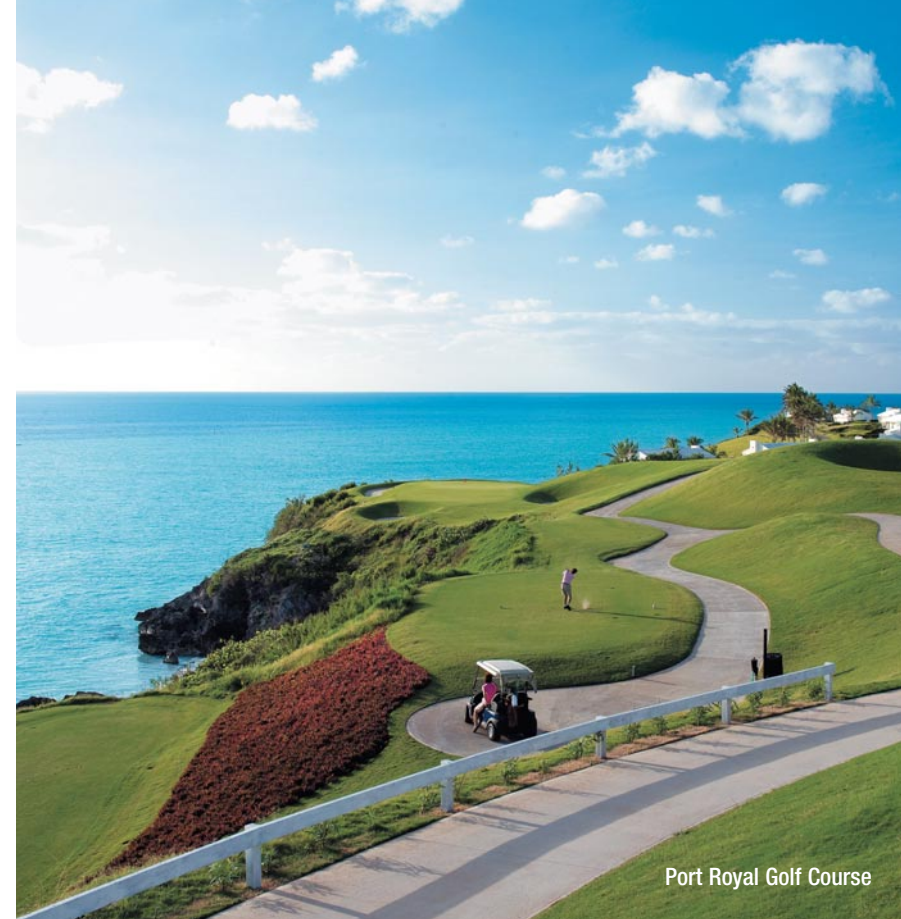
Port Royal Golf Course

BERMUDA is only 21 miles in length and two miles across at its widest point. With seven golf courses, it has one of the highest concentrations of golf per square mile in the world.