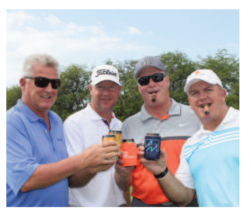
THE WINNING TEAM from South Hills Country Club in California.