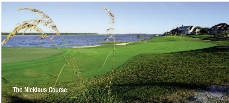
The Nicklaus Course

"This is the best course I have ever built." – PETE DYE