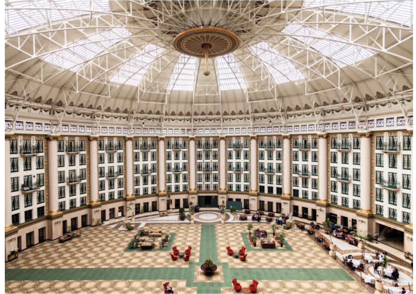
The West Baden Springs Hotel at French Lick Resort offers European luxury fashioned after the mineral spa of Baden-Baden in the Black Forest of Germany. Its 200-foot diameter atrium, referred to as the 8th wonder of the world, is a popular gathering spot for photo opportunities.

French Lick Resort recently completed a $581 million restoration and development project with both of its hotels: West Baden Springs and French Lick Springs. Combined, they offers 686 guest rooms and suites; the largest resort meeting space in the Midwest; a 51,000 square-foot casino; 63-holes of golf, including the Donald Ross Course and the Pete Dye Course; and two full-service spas. For more information on 2016 golf packages at French Lick Resort, please visit FrenchLick.com or call (888) 936-9360.