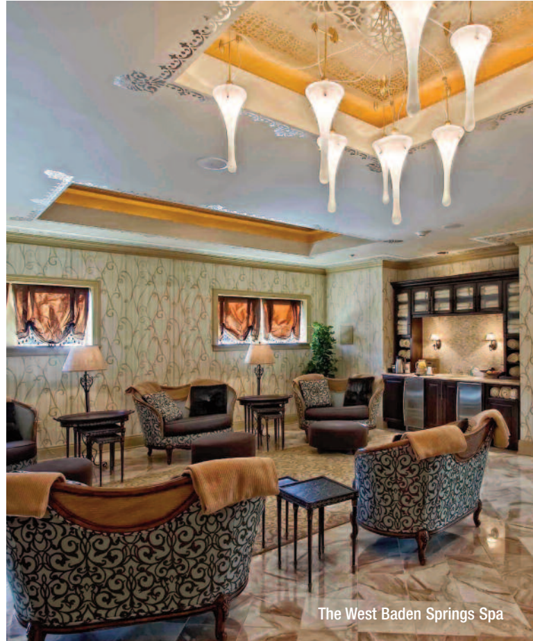
The West Baden Springs Spa

"One of my biggest highs occurred in 1999 with my win in Portland that qualified me for