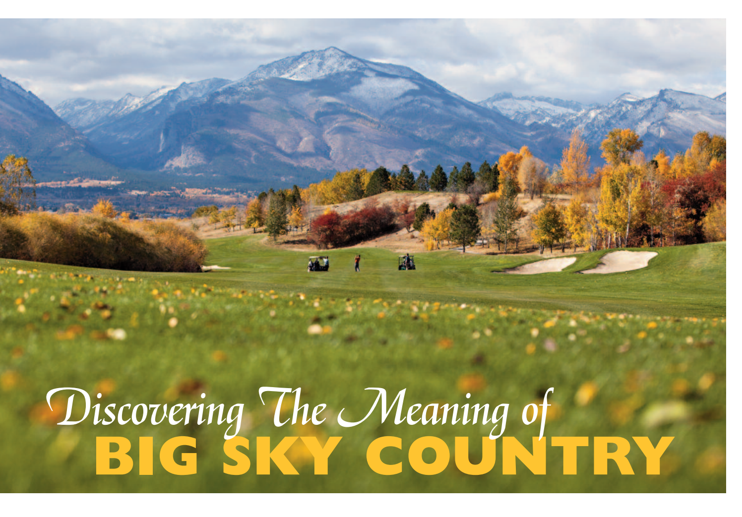
Stock Farm offers experiences as vast as Montana's landscape.

HAMILTON, MONTANA: Since the 1880s, 26 U.S. Presidents have served office (16 Republicans and 10 Democrats). During that same period, only two stakeholders have owned the land surrounding Stock Farm, an exclusive private community in the Bitterroot Valley.