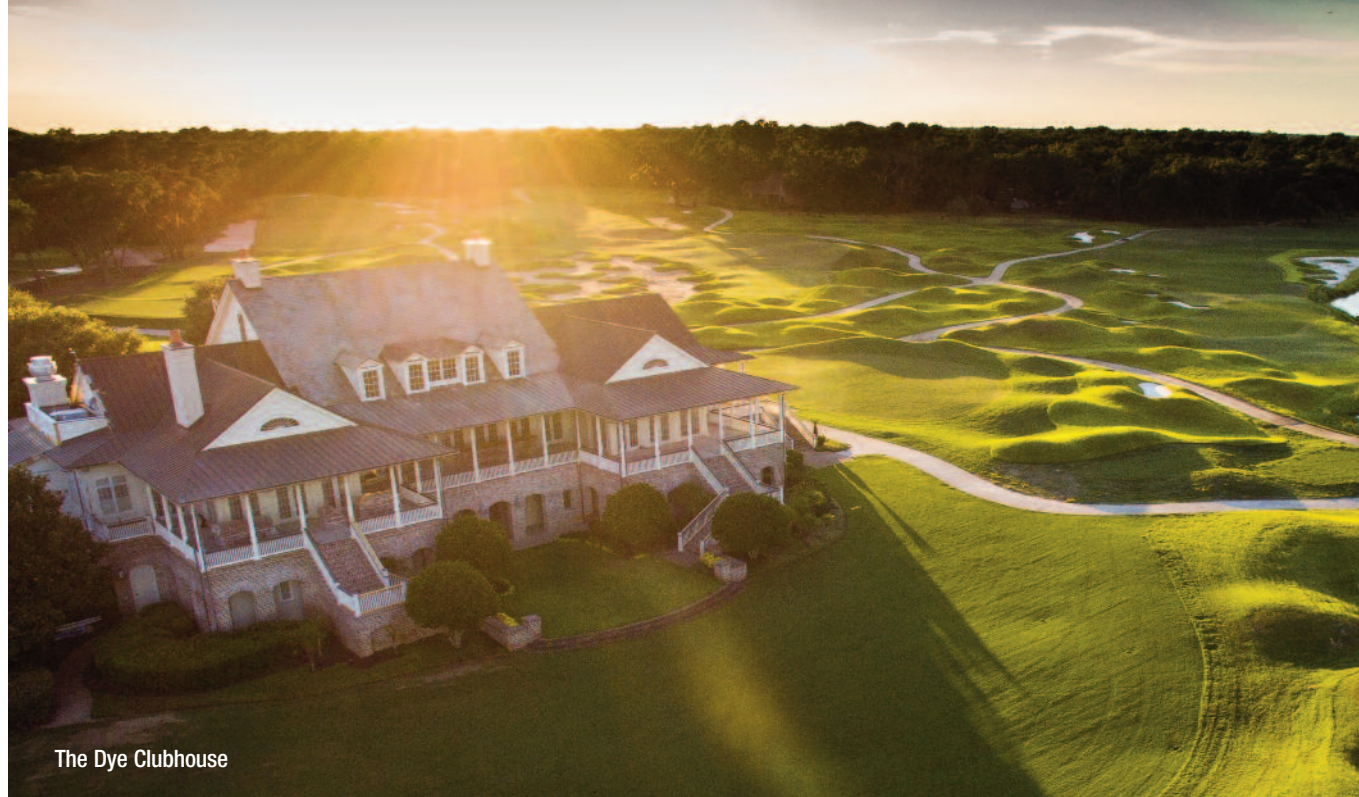
The Dye Clubhouse