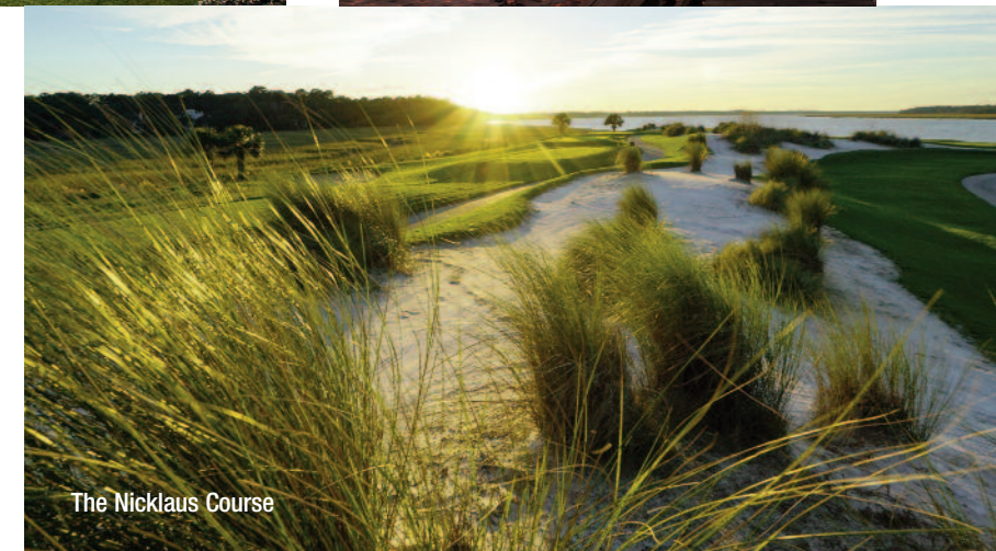
The Nicklaus Course