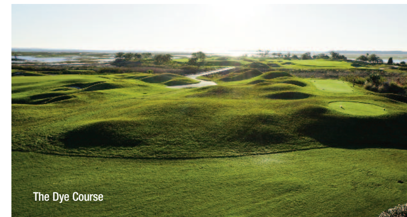
The Dye Course