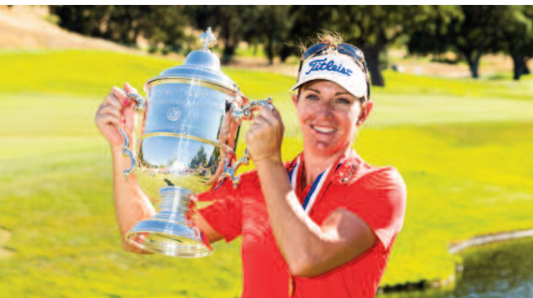
Brittany Lang, winner of the 2016 U.S. Women's Open.

SAN MARTIN, CALIFORNIA: Rosewood CordeValle is located on 1,700 acres of rolling foothills of the Santa Cruz Mountains. It features 45 luxurious accommodations, a Sense spa, three distinct restaurants, four plexicushion tennis courts, meeting space, and an on-site working vineyard and winery. Its Robert Trent Jones Jr. golf course has unobstructed views of Northern California's hillsides, canyons, and meadows.