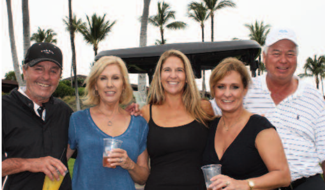
(Left/Above) Enjoying the camaraderie of the Horse Race Shootout.