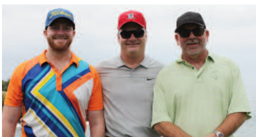
(Above) Team South Hills from California. (Below) Team Braemar from California dodging a rain shower.