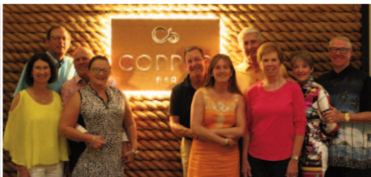
(Left) Team Hurricane Creek from Texas line up at the sundae dessert bar during the Welcome Dinner. (Above) Enjoying the night at the Copper Bar.