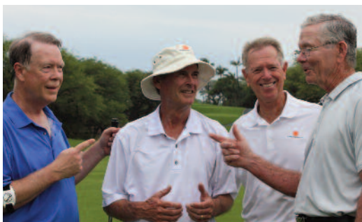
Team Big Canyon CC from California debating strategy.