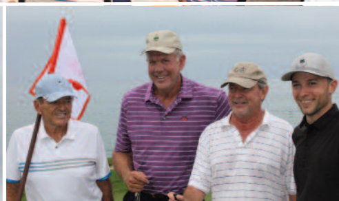
Team Plantation GC from California on Mauna Kea's famous 3rd hole.