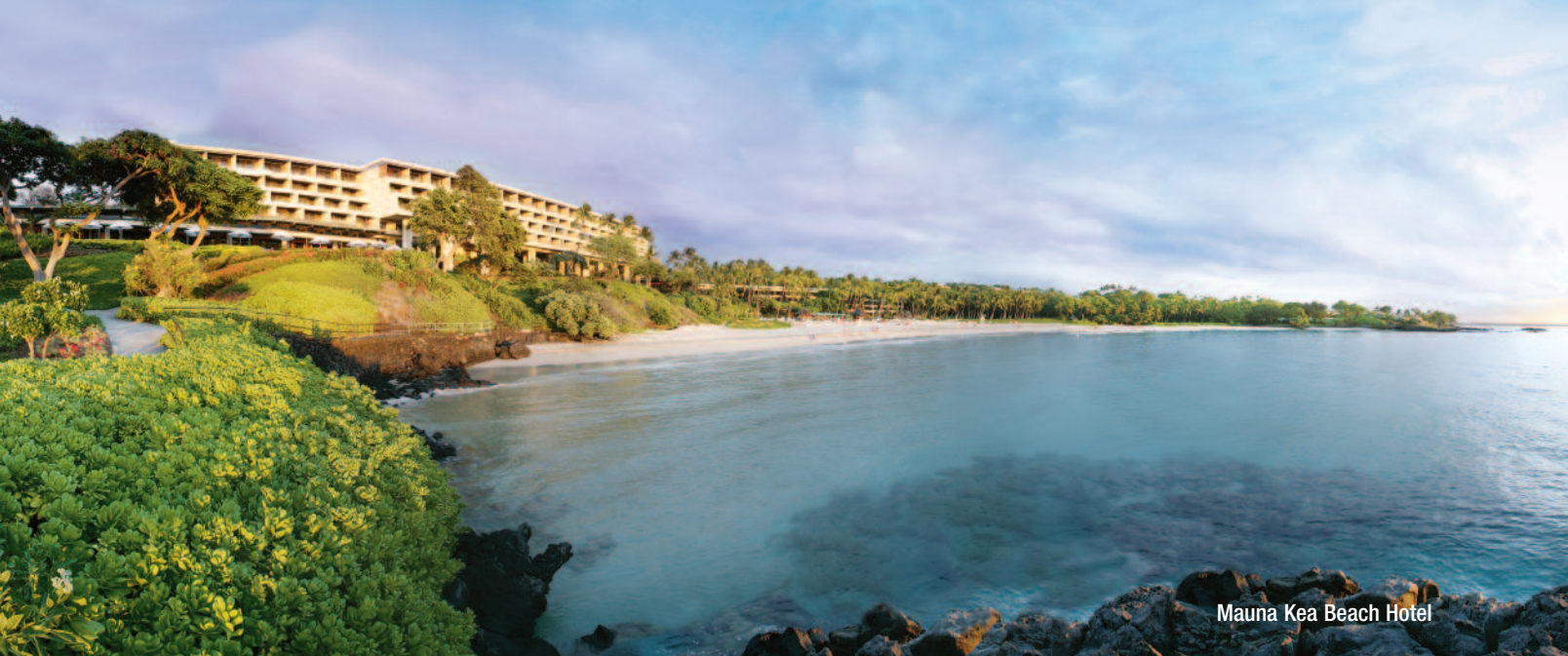
Mauna Kea Beach Hotel