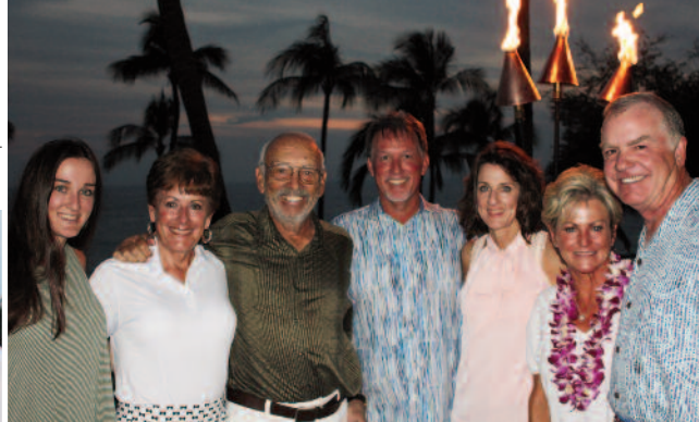
(Left) Team Bermuda Dunes CC from California at Welcome Reception. (Above) Team La Quinta from California at Welcome Reception. (Below) Welcome Dinner in the Kauna'oa Ballroom.