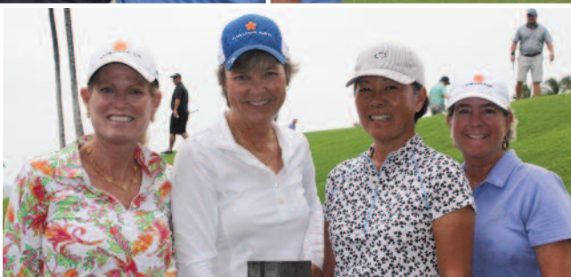
(Above) Team One Valley Club in California. (Below) Team Two Valley Club in California.