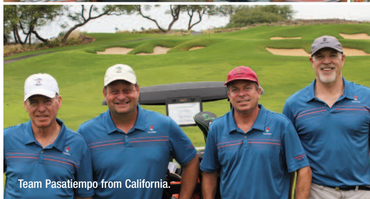
Team Pasatiempo from California.