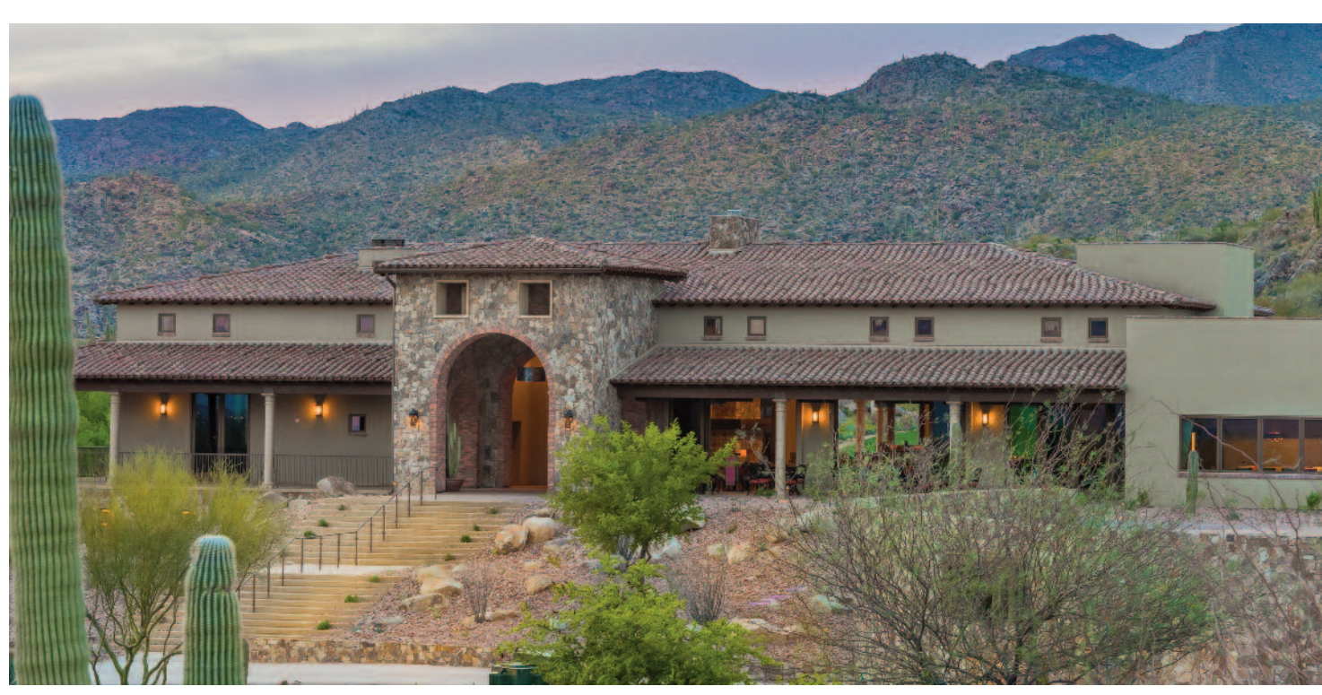
The hacienda-style, rectangular Stone Canyon clubhouse, designed by Erik Peterson, utilizes natural light. It's hard to tell whether you are indoors or out. The dining room and bar open to the patio. The clubhouse has a couple of showstoppers. The fireplace mantle and dining room tables are made from reclaimed wood of a 1920s cotton mill from Truman, Arkansas, and the bar has a zinc countertop with punches of color throughout.

"We also have a comprehensive practice facility with 12 acres of turf dedicated to game improvement and four short game complexes."