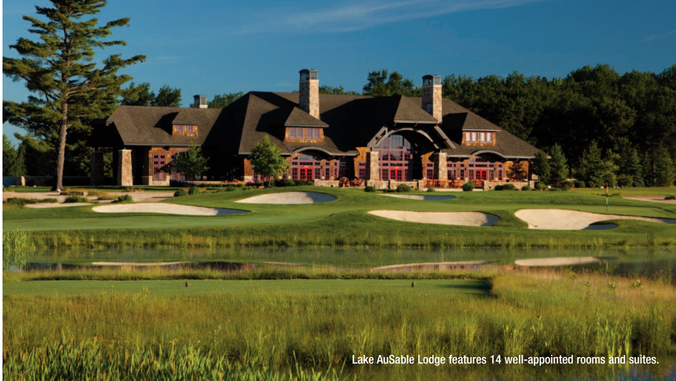
Lake AuSable Lodge features 14 well-appointed rooms and suites.