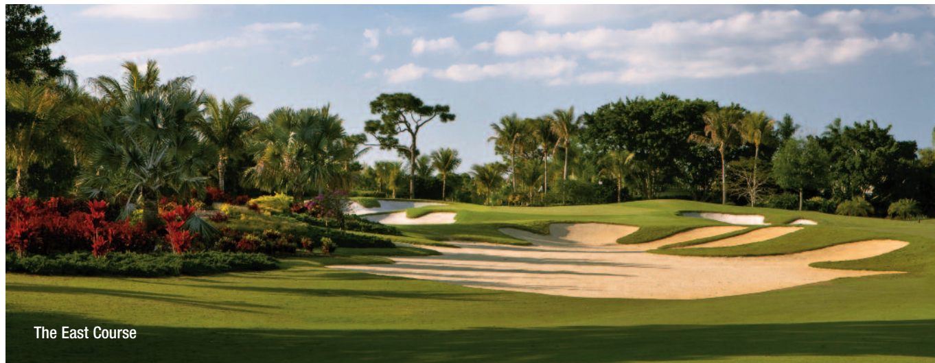
The East Course

BallenIsles is a member-owned private community with 1,575 homes. Members have access to three golf courses, a