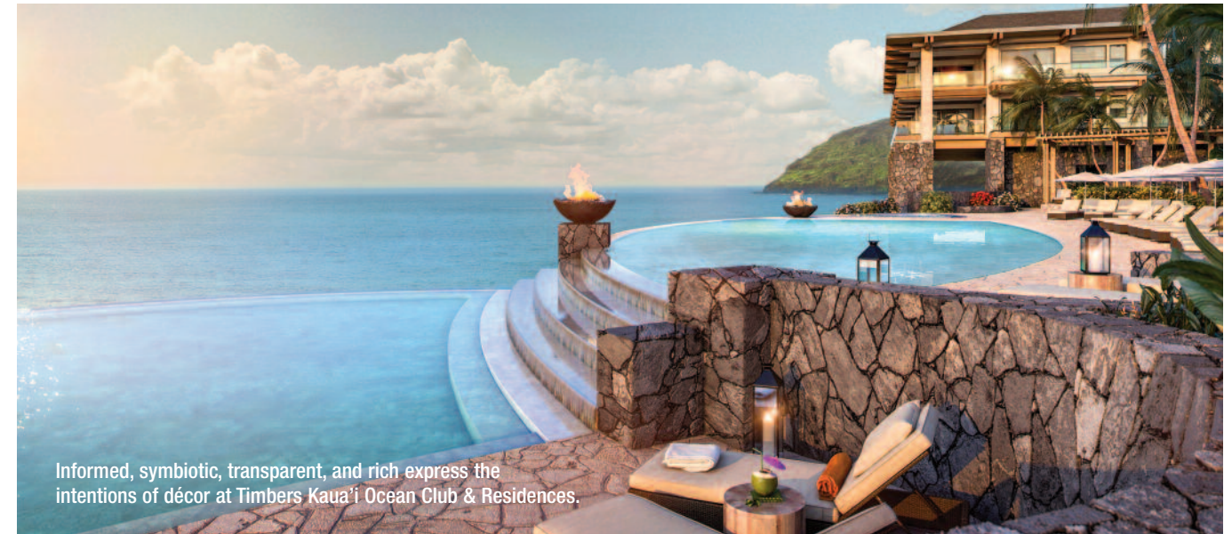
Informed, symbiotic, transparent, and rich express the intentions of décor at Timbers Kaua’i Ocean Club & Residences.

THE TIMBERS KAUAI ADVENTURE GUIDES will escort through the Kalalau Trail (considered one of the most spectacular hikes in the world), visit the Fern Grotto (once reserved exclusively for Hawaiian royalty), and snorkel in the warm waters (Kauai has 680 different species of fish).