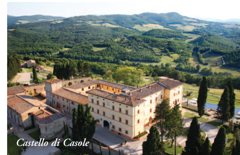
Castello di Casole

Timbers Resorts’ members have reciprocity throughout its portfolio of properties, including Kiawah Island, South Carolina, and Castello di Casole in Italy, voted the No.1 resort in Europe by Travel+Leisure for five consecutive years.