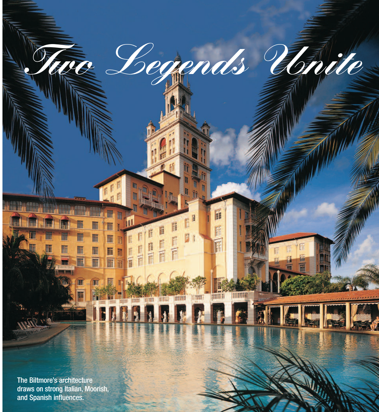
The Biltmore's architecture draws on strong Italian, Moorish, and Spanish influences.

The Jim McLean Golf School, recognized by U.S. News & World Report, CNN, and Travel+Leisure as the No. 1 Golf School in America, opens shop at The Biltmore.