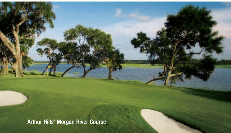
Arthur Hills' Morgan River Course

For more information on Dataw Island Club and their stay-and-play Experience Package, please visit Dataw.com or call (843) 838-3838.