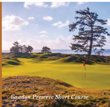
Bandon Preserve Short Course