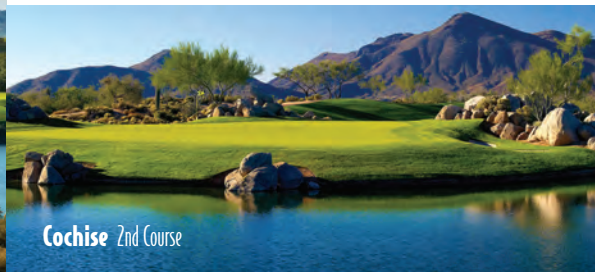
Cochise 2nd Course