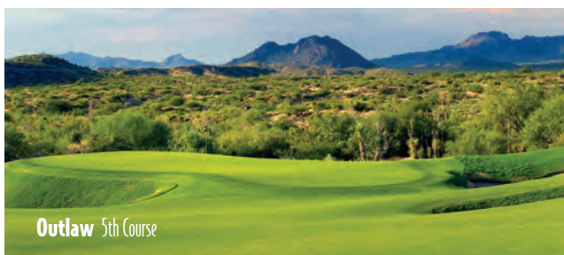
Outlaw 5th Course