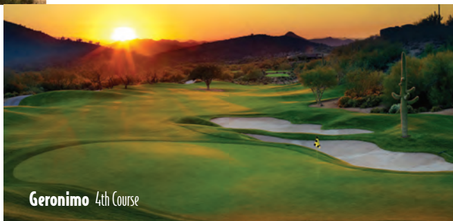
Geronimo 4th Course