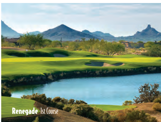
Renegade 1st Course

IN ADDITION to its new short course, Desert Mountain has committed $14 million to the redesign and renovation of the Renegade Course.