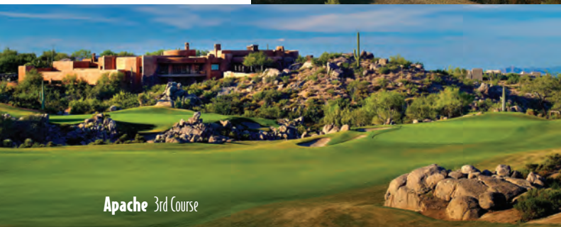
Apache 3rd Course