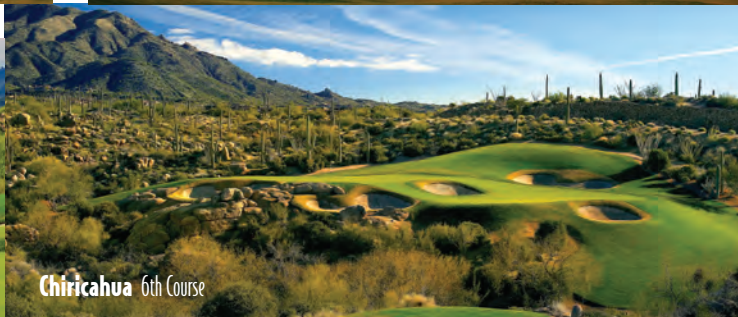
Chiricahua 6th Course