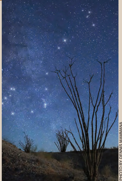
Borrego Springs, with little nighttime light pollution, is designated as an International Dark Sky Community.

Rams Hill. "Borrego Springs provides an experience similar to what you would find in Palm Springs back in the