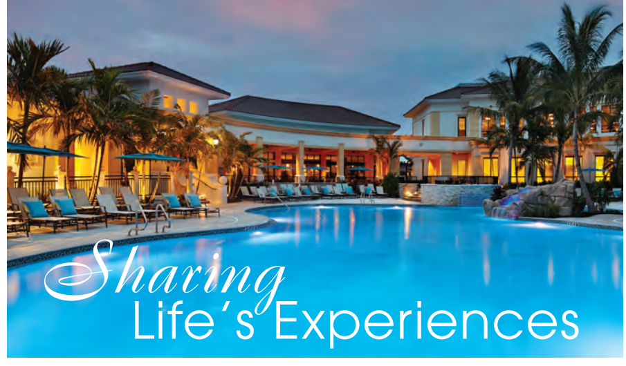
In the past five years, the private community has invested more than $40 million in member amenities, including a new Clubhouse, Sports Village, and a new Jack Nicklaus Signature Course.

The Club at Ibis offers dozens of "clubs within a club."