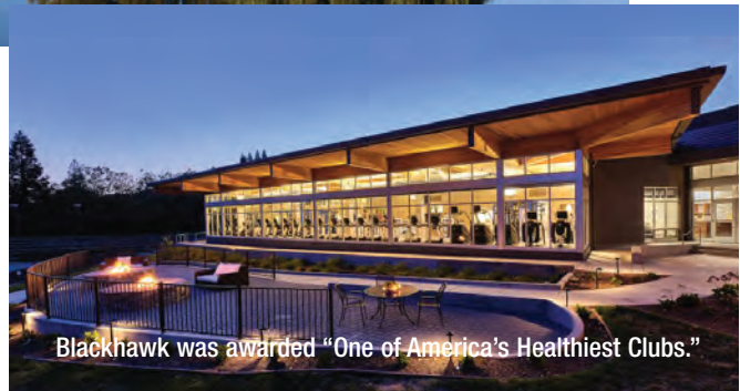
Blackhawk was awarded “One of America’s Healthiest Clubs.”

“That’s not to say we have ignored golf,” concluded Dunne. “We installed a modern irrigation system and continue a drought beautification program. We want to be