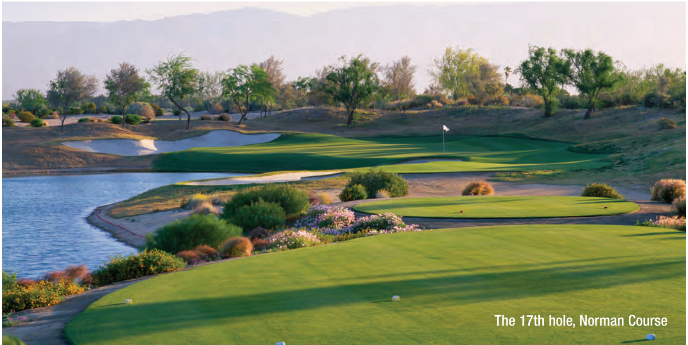
The 17th hole, Norman Course