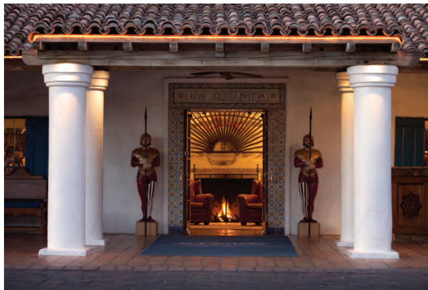
THE LA QUINTA HOTEL (today La Quinta Resort & Club) opened in 1926, featuring 20 guest casitas, an open-air glassed dining room, and three courtyards. Built at a cost of $150,000, word of the luxury escape spread to Hollywood with Greta Garbo, Clark Gable, and Shirley Temple being frequent guests.

"If the idea of a day of golf, followed by a steak BBQ on your outdoor patio sound appealing, a visit to our oasis in the desert might quench your thirst as the ultimate vacation option." ■