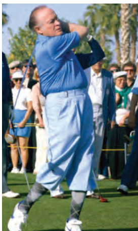
Bob Hope at the Desert Classic (circa 1970s).

golf experience is to book with La Quinta Resort Leasing, allowing you and your family the opportunity to rent a home on property at PGA West and enjoy the amenities of La Quinta Resort & Club.