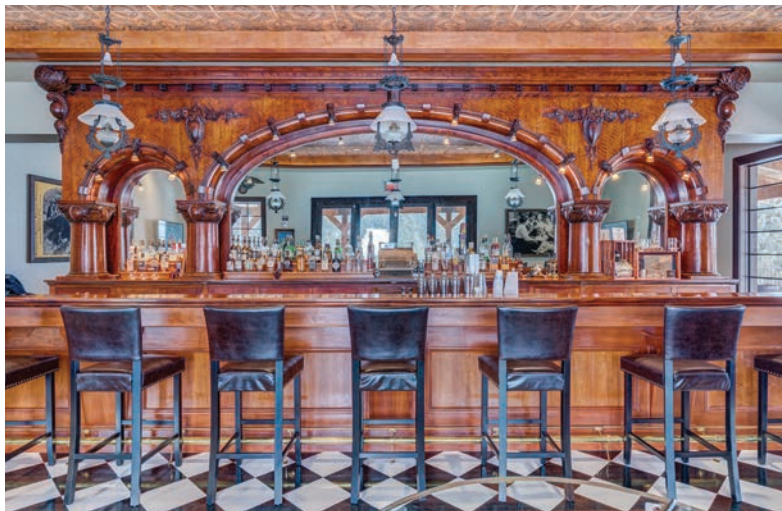
The back bar in the clubhouse saloon dates to the late 1890s. Rumor has it a few of the more notorious Black Hills pioneers, including Seth Bullock, bellied up to the bar.