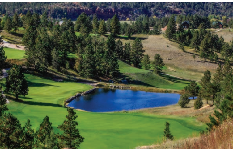
Bunkers are rough around the edges and fairways are framed by native grasses. The front nine plays through an open prairie and the back nine has more trees and elevation changes. The trio of holes 11, 12, and 13 play to the canyon rim with clear views of Devils Tower in the distance.