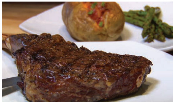
The club has a ranch-to-table partnership with Durham Ranch in nearby Wright, Wyoming (one of the largest bison ranches in North America).