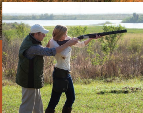
Streamsong sporting clays guides are NSCA (National Sporting Clays Association) certified.

For information on seasonal golf packages, please visit StreamsongResort.com .