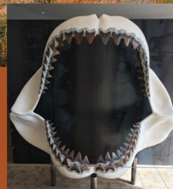
The Florida Peninsula used to be covered by ocean. It's not uncommon for caddies to stumble across a shark tooth fossil while looking for your ball in the sandy waste areas.