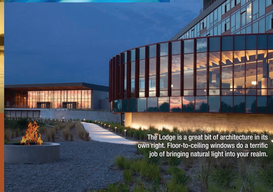
The Lodge is a great bit of architecture in its own right. Floor-to-ceiling windows do a terrific job of bringing natural light into your realm.