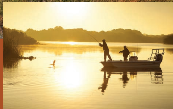
The depth and water quality sustain a healthy population of fish at Streamsong. It's not uncommon for an angler to hook an eight-pound bass (the record is nearly 14 pounds).