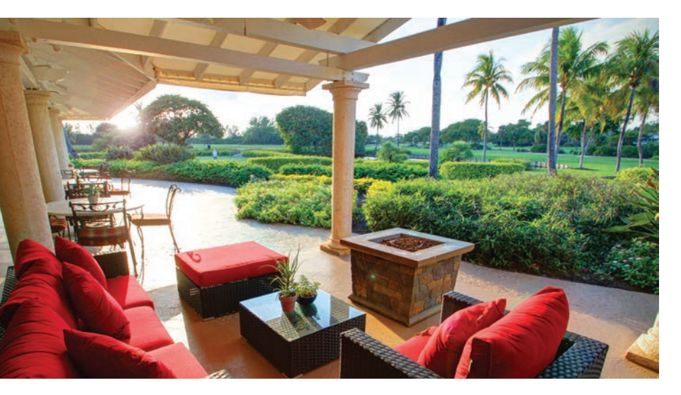
The Coral Ridge Country Club clubhouse features distinctive mid-century modern architecture with panoramic views of the golf course and pool pavilion.

The $9 million capital project is entering the home stretch with completion before the start of season. "The project was completed on time and, more importantly, without the club incurring debt," concluded J.J. "Best of all, we stayed true to the original vision of Robert Trent Jones and his quote 'there will be no weaknesses, they all will be great holes' still rings true."