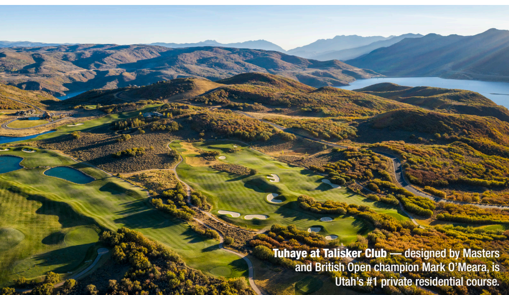
Tuhaye at Talisker Club — designed by Masters and British Open champion Mark O'Meara, is Utah's #1 private residential course.

For more information on the ultimate four seasons lifestyle, please visit TaliskerClub.com .