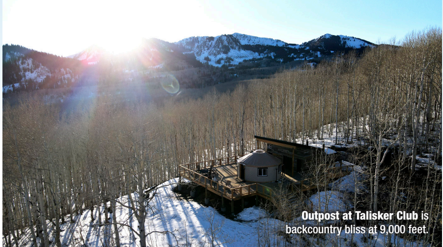
Outpost at Talisker Club is backcountry bliss at 9,000 feet.