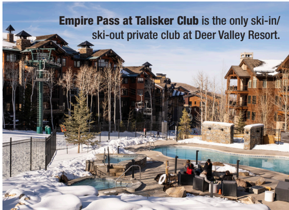
Empire Pass at Talisker Club is the only ski-in/ski-out private club at Deer Valley Resort.