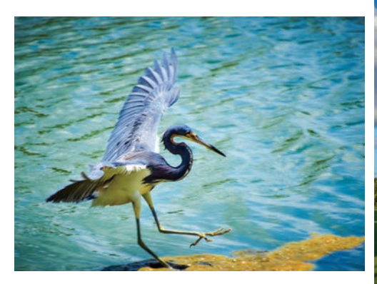
The Club at Ibis shares a common property line with the Grassy Waters Nature Preserve. Birdlife doesn't know the difference. The courses are filled with visiting sandhill cranes, blue herons, and roseate spoonbills.