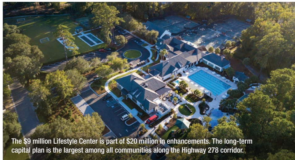
The $9 million Lifestyle Center is part of $20 million in enhancements. The long-term capital plan is the largest among all communities along the Highway 278 corridor.