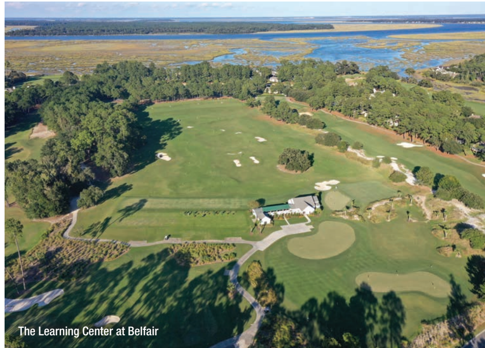
The Learning Center at Belfair

For more information, please visit their website at Belfair1811.com .