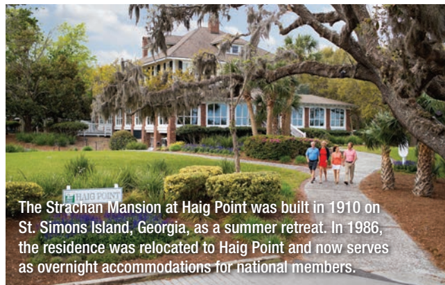
The Strachan Mansion at Haig Point was built in 1910 on St. Simons Island, Georgia, as a summer retreat. In 1986, the residence was relocated to Haig Point and now serves as overnight accommodations for national members.

For more information, please visit HaigPoint.com .