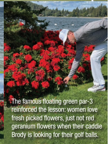
The famous floating green par-3 reinforced the lesson: women love fresh picked flowers, just not red geranium flowers when their caddie Brody is looking for their golf balls.