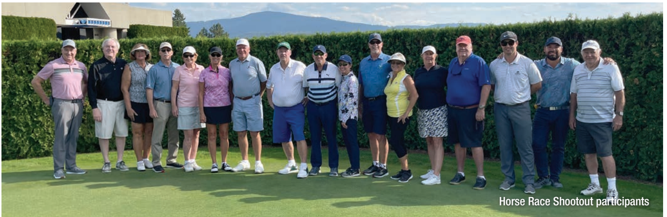
Horse Race Shootout participants

When the Cordilleran Ice Sheet flowed south from Canada approximately 15,000 years ago, it helped create the topography necessary for Lake Coeur d’Alene. Today, the pristine body of water has over 100 miles of shoreline. The Coeur d’Alene Resort started as a small lakefront motel. When the impressive 18-story tower opened, 25,000 locals showed up for a tour, backing up the off-ramp on Interstate 90.