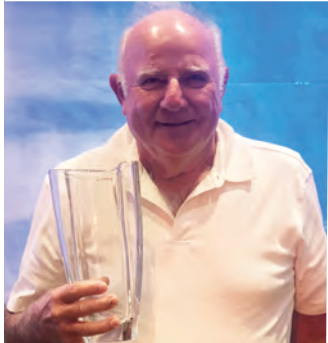
BOB HOPE Del Paso CC, CA 75+ Age Division – Gross