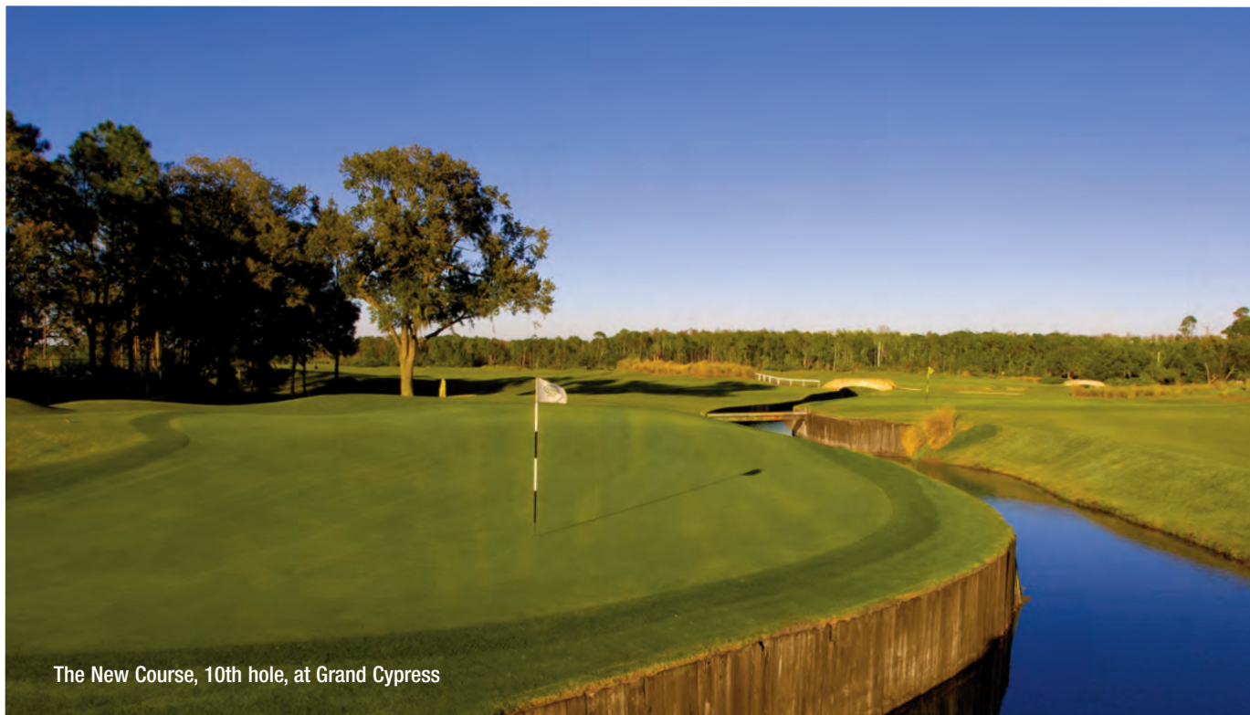
The New Course, 10th hole, at Grand Cypress

Executive Cup is America's only tournament exclusively for private golf club champions.