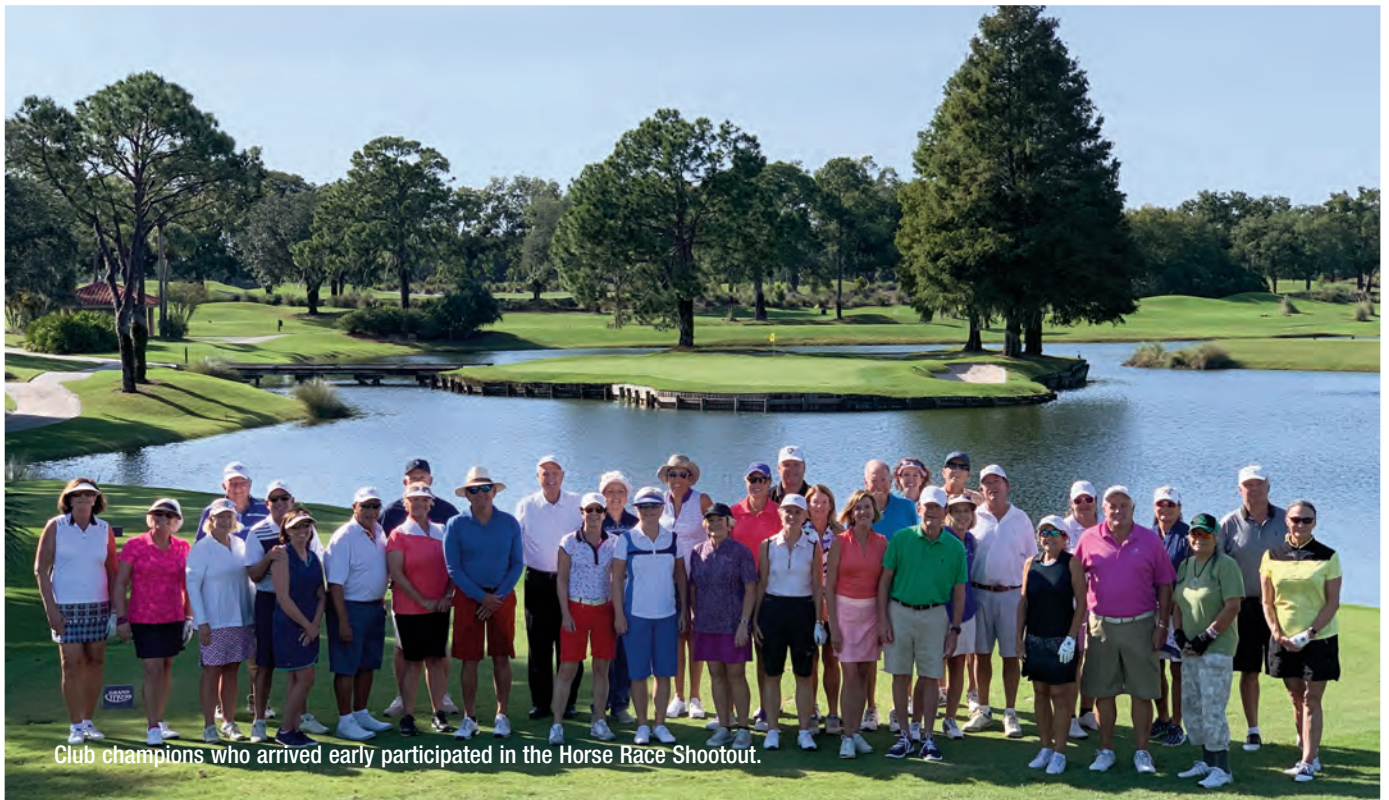
Club champions who arrived early participated in the Horse Race Shootout.