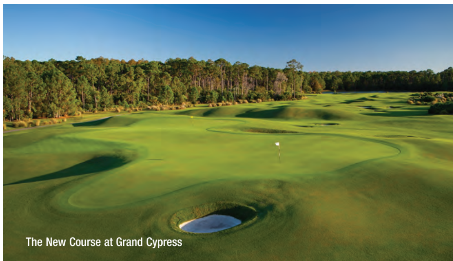
The New Course at Grand Cypress

Golf amenities included the Jack Nicklaus designed North, South, and East nines; The New Course (the Golden Bear's tribute to the Old Course at St. Andrews); and the Academy of Golf, with a 21-acre practice facility and three Nicklaus designed regulation length practice holes. ➤