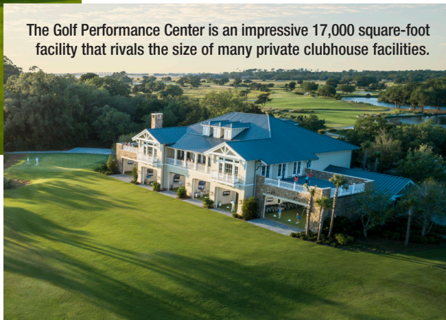
The Golf Performance Center is an impressive 17,000 square-foot facility that rivals the size of many private clubhouse facilities.