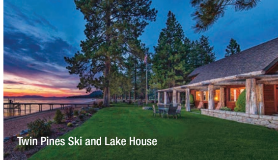
Twin Pines Ski and Lake House

The new clubhouse overlooks the 18th fairway and 50-mile mountain views. Firepits and a favorable elevation allow almost year-round gatherings on the terrace.