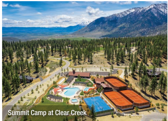
Summit Camp at Clear Creek

We want you to have plenty to remember from your round, but also some ideas to look forward to trying tomorrow." — BEN CRENSHAW