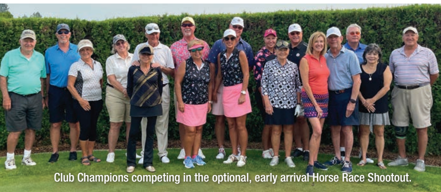
Club Champions competing in the optional, early arrival Horse Race Shootout.

After completion of play, competitors enjoyed a private dinner cruise and tour of the Hagadone Gardens and Estate (founder of Coeur d'Alene Resort). The estate maintains over 300,000 different plants overseen by an experienced team of seven botanists. As an added bonus, competitors were granted access to the Hagadone Garage to view its collection of vintage cars.