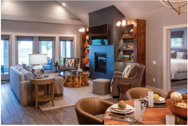
Member Cottages are multifunctional and well appointed.

course architects. They are drawn to our palette of elevation change, deciduous trees, and stunning scenery. You will have impactful views of the bay no matter where the compass points."