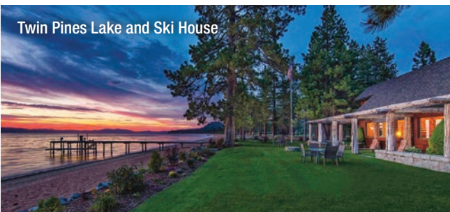
Twin Pines Lake and Ski House