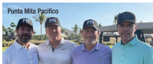
Punta Mita Pacifico