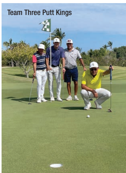
Team Three Putt Kings