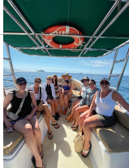
“Catch” a sunset as you enjoy the fresh “catch of the day.”

Golfers had a casual practice round followed by an afternoon, four-hole Horserace Shootout with 15 teams in attendance. Teams were eliminated until the field was whittled down to three, with the competition concluding on the iconic third hole, an island green par-3. After the dust settled, The A Team from Arizona proved victorious and 50,000 American Airlines miles richer for their endeavor.