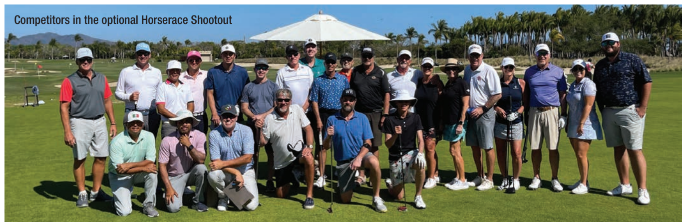
Competitors in the optional Horserace Shootout