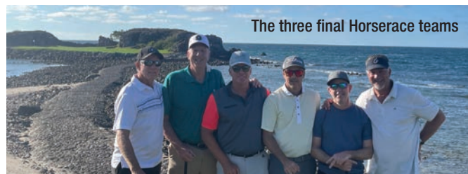
The three final Horserace teams