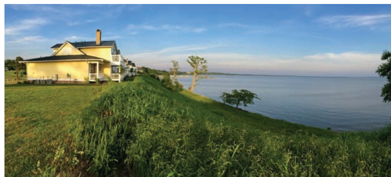
Cottages on the James, available for nightly rental, feature modern Cape Cod architecture. If you are looking for the pinnacle of luxury, consider The Estate at Kingsmill Resort, a 7,000 square-foot, four-bedroom mansion built by the Busch family.