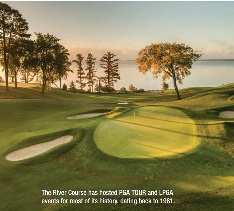
The River Course has hosted PGA TOUR and LPGA events for most of its history, dating back to 1981.