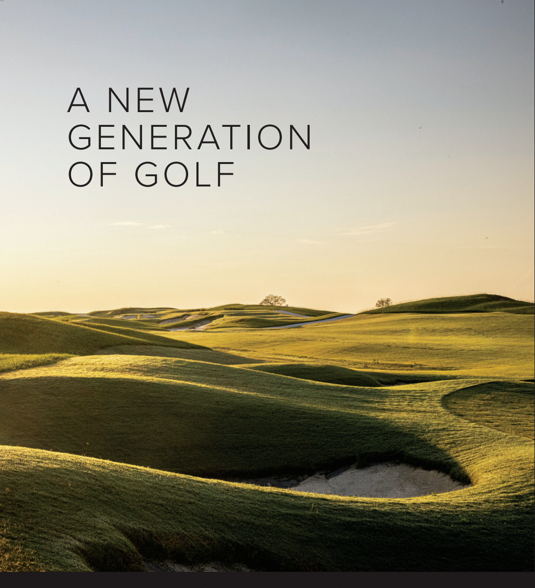
LUXURY REAL ESTATE | RESORT AMENITIES | CHAMPIONSHIP GOLF