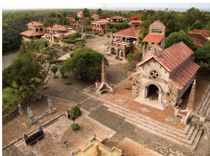
Altos de Chavón is a replica 16th century Mediterranean village accessible via golf cart from the main resort.

For more information, please visit CasaDeCampo.com.do .