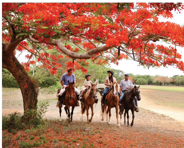
The equestrian center is among the best in the Caribbean.