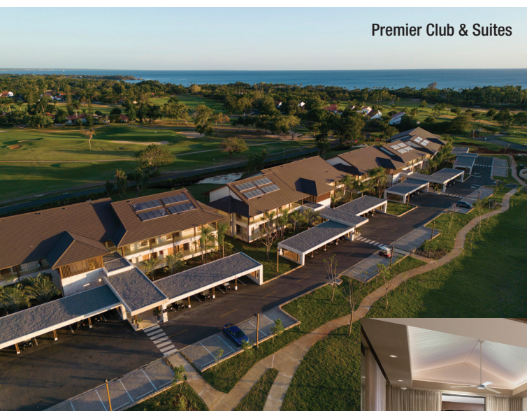
Premier Club & Suites

The 245-acre outdoor Shooting Centre has 200+ stations for trap, skeet and sporting clays, and pigeon rings. Its 110-foot tower that projects sporting clays is one of the largest in the world.