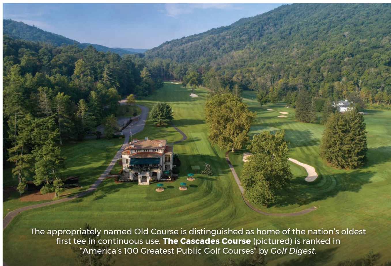
The appropriately named Old Course is distinguished as home of the nation's oldest first tee in continuous use. The Cascades Course (pictured) is ranked in "America's 100 Greatest Public Golf Courses" by Golf Digest .